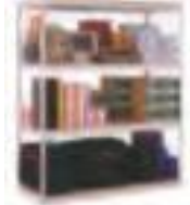
SHELVING & DRAWERS