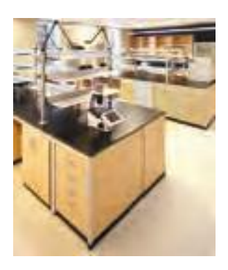
CLEAN ROOM AND BIO-TECH