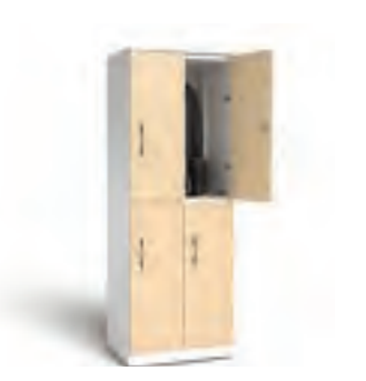
LOCKERS-KEYED AND ELECTRONIC