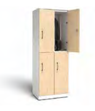
LOCKERS-KEYED AND ELECTRONIC