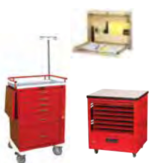
SECURITY CARTS AND WALLRIGHTS